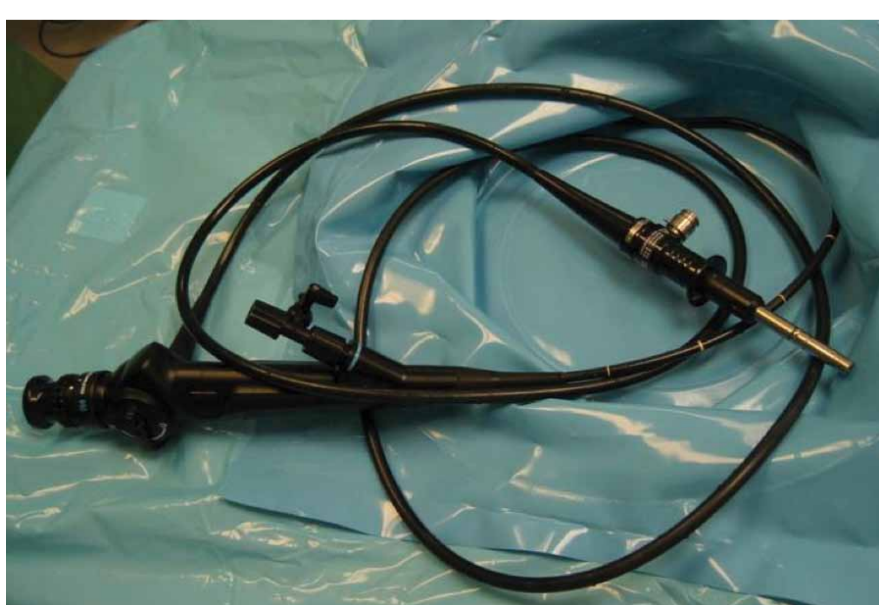
Figure 1: Flexible Cystoscope

*Tests if current Cidex OPA Solution still valid +Or earlier if the Cidex OPA Solution fails testing with test strips