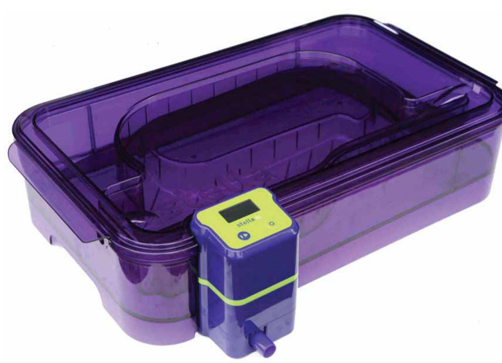
Figure 2: Stella Disinfection Tray