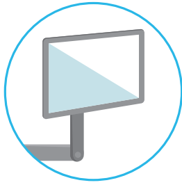
WORKSTATIONS (MONITORS & KEYBOARDS)