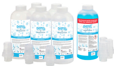
1 LITRE DISTEL DS STARTER PACK CCH050101

Each dose is consistent, resulting in uniform disinfection for increased compliance.