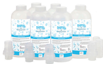
1 LITRE DISTEL DS DOSING BOTTLES CCH050301

1 x 1 Litre Bottle of Concentrate - 1 x 5ml Dosing Head - 1 x Working Solution Bottle Label