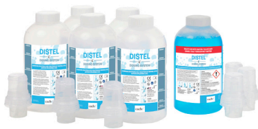
500ml DISTEL DS STARTER PACK CCH050401

2000 DOSES PER 1 LITRE CONCENTRATE BOTTLE