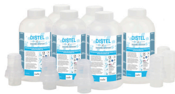
500ml DISTEL DS DOSING BOTTLES CCH050601

1 x 500ml Bottle of Concentrate - 1 x 5ml Dosing Head - 1 x Working Solution Bottle Label